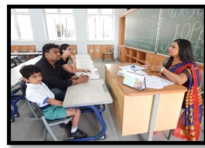
Important Points / School Rules