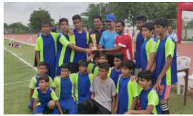
Cygnus World School's Soccer Team is the District Level Winner of the Subrato Mukherjee Football Tournament, Under 14.. It is a proud moment because they were the Runners up for the State Level as well.