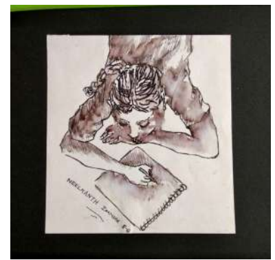
Neelkanth Inamdar VIII-B