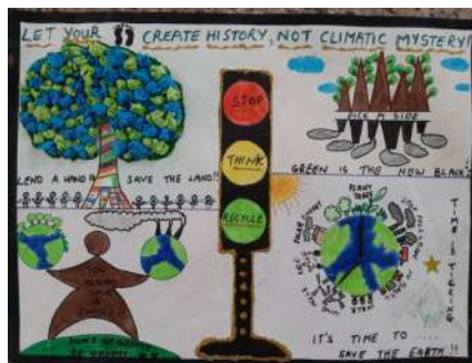
Mikhail Desai V-B