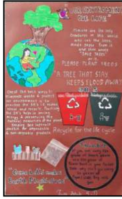
Tirth Shah V-D