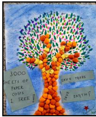
Nitya Agrawal V-D