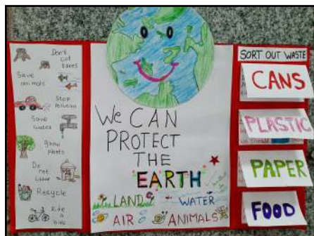
Shree Patel V-D