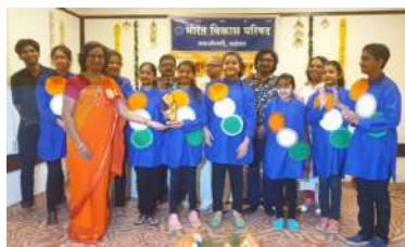
Cygnus World School won the Third position in the National Group Singing Competition in category Sanskrit organised by Bharat Vikas Parishad Vadodara Chapter for the students of Grade VI to IX .