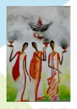
Ashmita Ukil, IX A